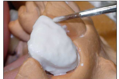
Photo 2 Layering