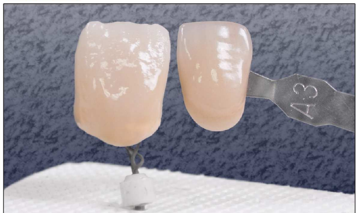
Photo 4 the finished element

The composition of the Natural THE ONE ZiR system