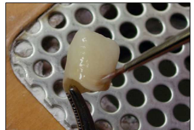
Photo 3 Staining